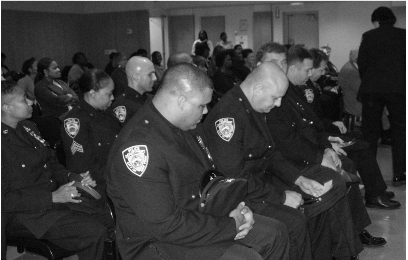
Trainings for NYPD officers on the cultural context for domestic violence in the Haitian community helped to reduce dual arrests and improve incident resolution.

to 2006. Major domestic violence felony crimes have also decreased. Haitian New Yorkers attest that reductions in violence in their community are a part of this story. Community members regularly call Radio