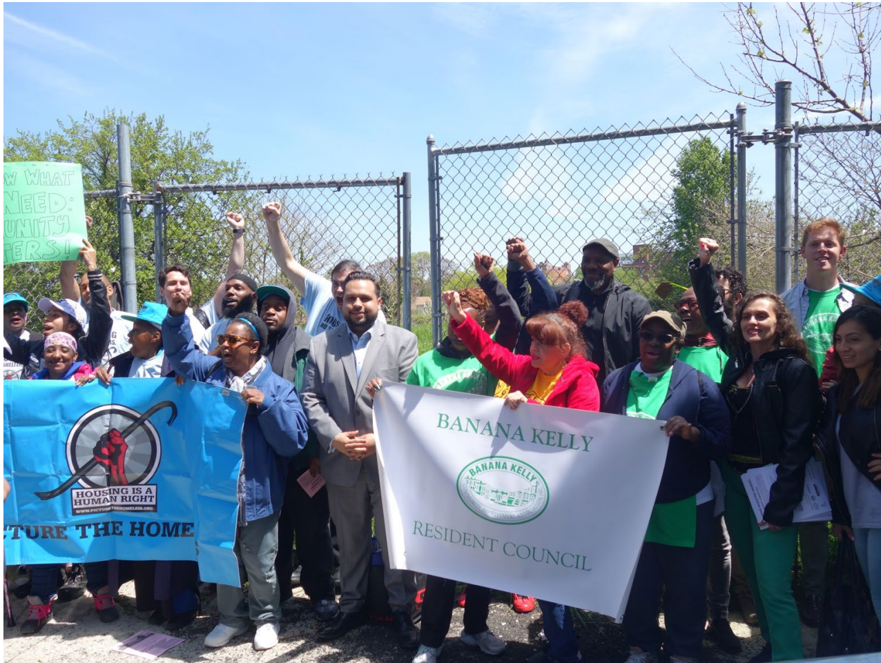
NYCCLI members rally in support of the Housing Not Warehousing Act in 2017.