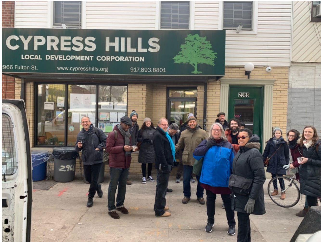
The Learning Exchange at site visits hosted by Cypress Hills LDC and the Community Solutions Brownsville Partnership.