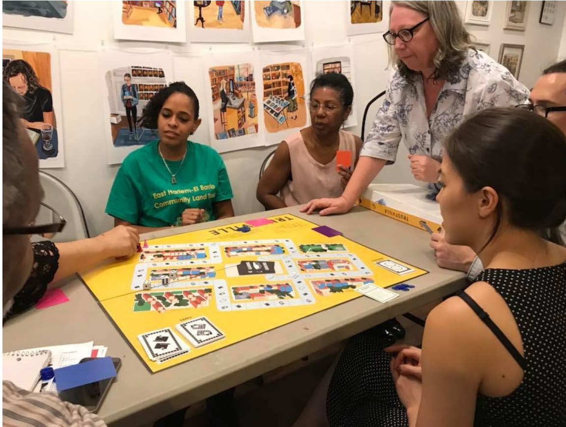
Northern Manhattan CLT and East Harlem-El Barrio CLT facilitate a game of Trustville.