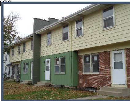
4 Rental Units