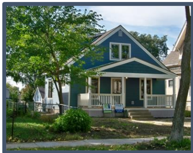
210+ Single Family Homes