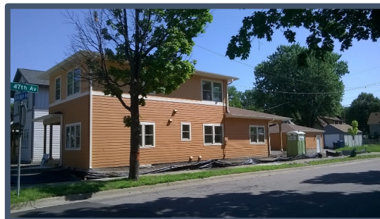
2 ADU's (+ 2 under construction)