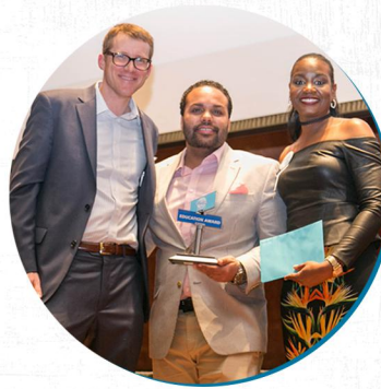
LOVE Thy Neighborhood Awards