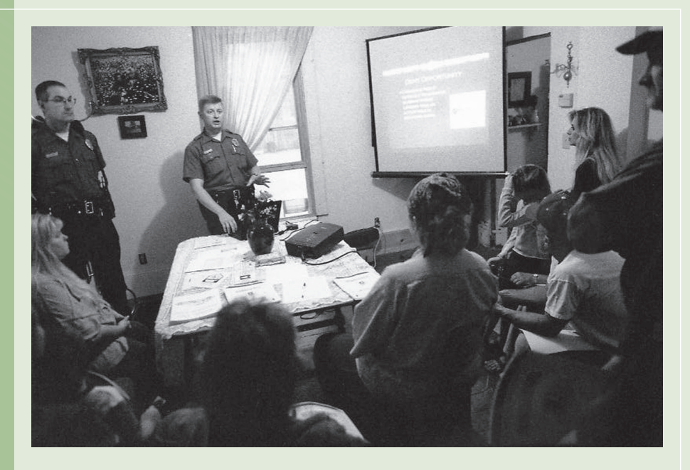
Catalyst for Collaboration Roles of a Safety Coordinator