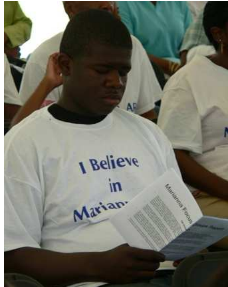
Studying the Focus Group Summary Report