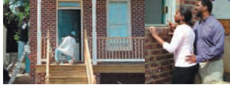
New construction in the Carver neighborhood.