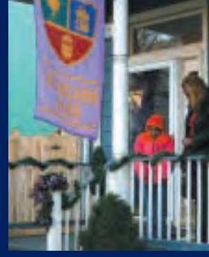
Highland Park residents

"As we continue to expand the breadth of our community rebuilding activities, LISC has been an effective partner in helping us increase the scale and diversity of our real estate activities with the right development team members as well as access to essential financial and political support."