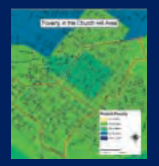
Poverty in Church Hill

"LISC helps bring planning and measurement resources to the community rebuilding industry to maximize positive neighborhood change and broaden public and private accountability through its research and impact analysis services."