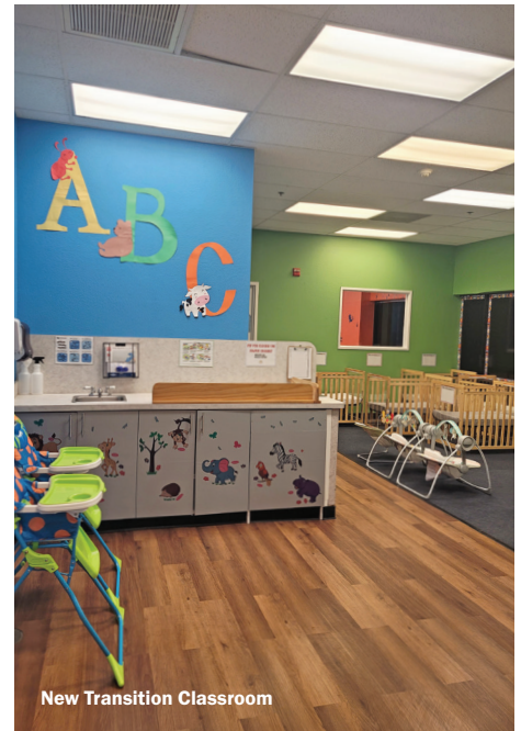
New Transition Classroom