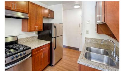
Ocean Bay (Bayside)