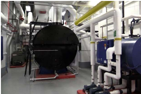
New and improved building systems at Ocean Bay (Bayside)