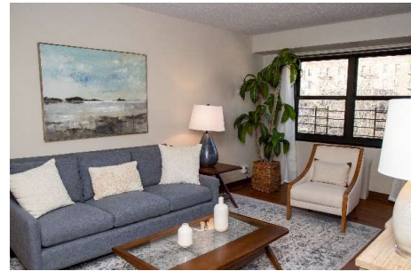
Newly renovated apartment at Twin Parks West