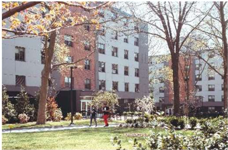
Site improvements at Baychester and Betances