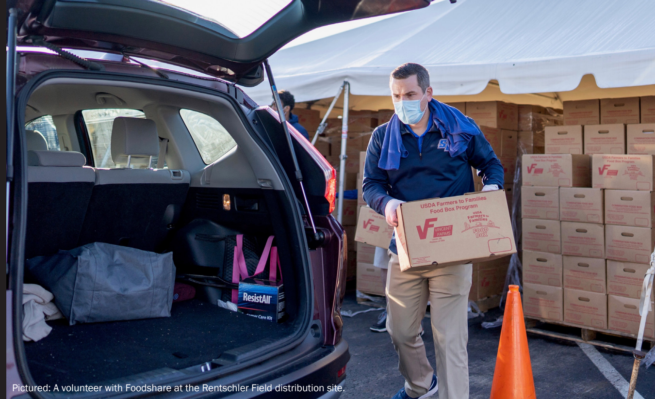
Pictured: A volunteer with Foodshare at the Rentschler Field distribution site.