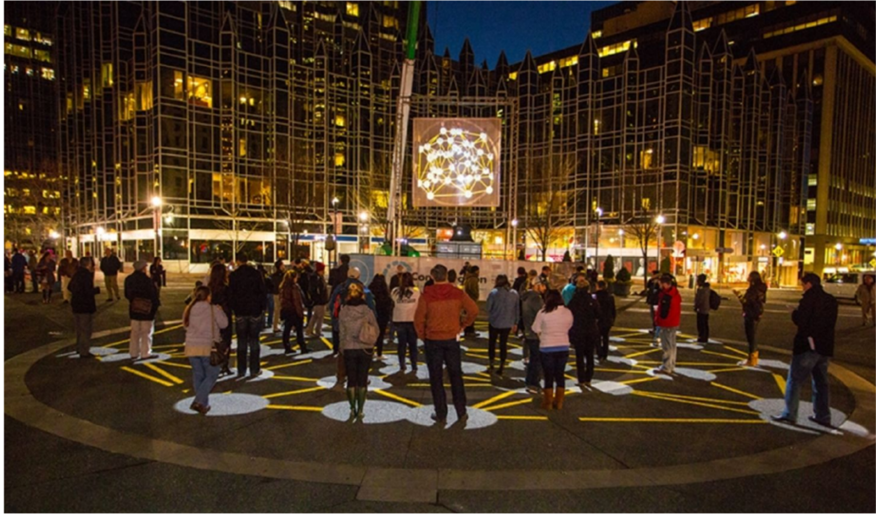
Congregation , 2014 by KMA, Pittsburgh, PA