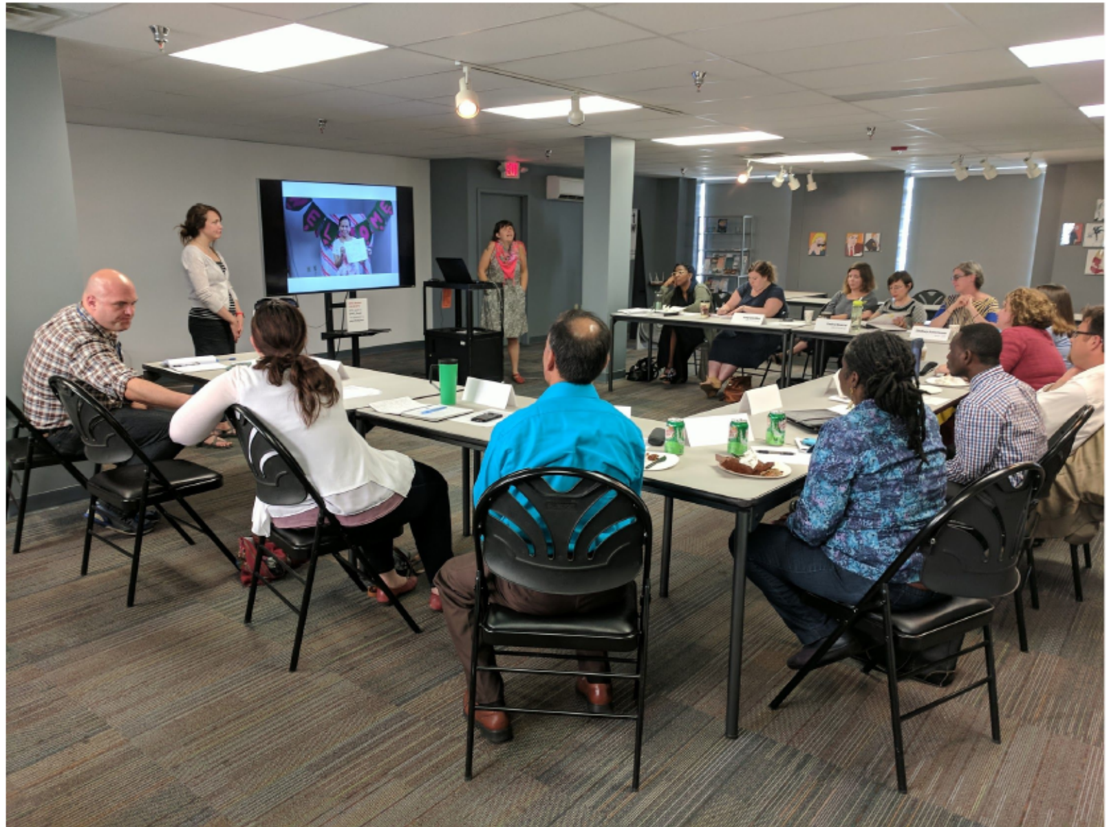
Artist Residency Cohort, 2017 Pittsburgh, PA

Talk honestly about politics, problems, challenges, solutions