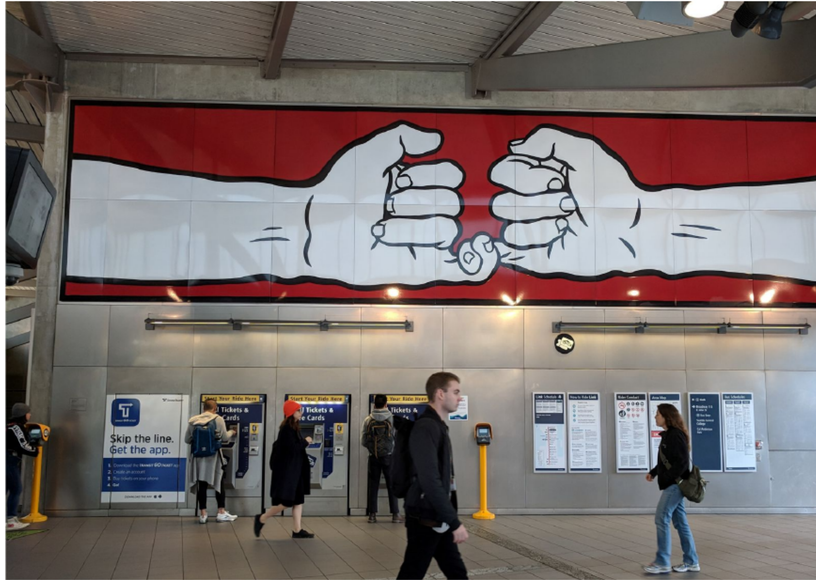
Crossed Pinkies , 2015 by Ellen Forney, Seattle, WA